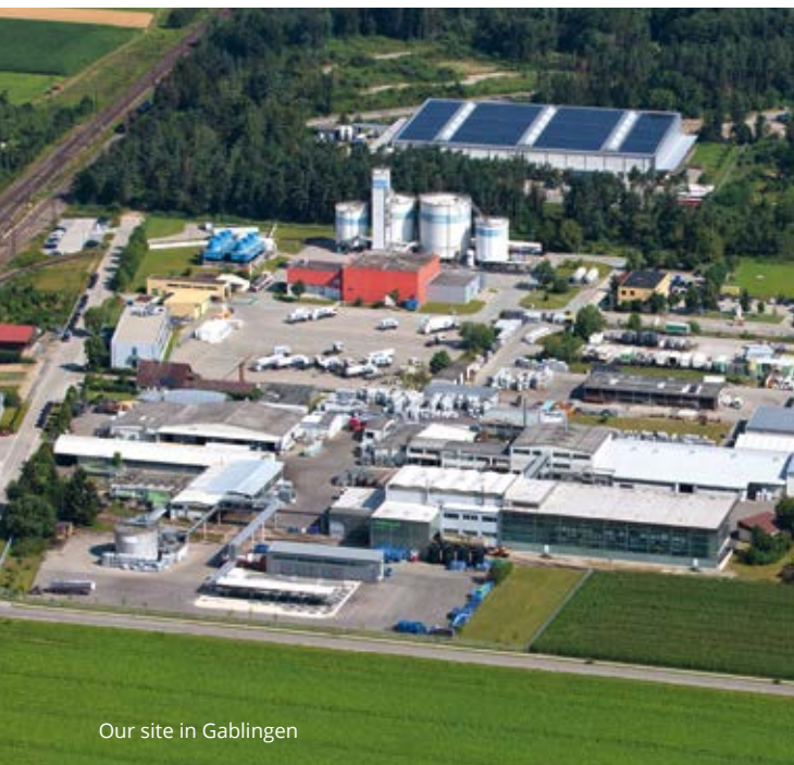
Our site in Gablingen

We maintain a comprehensive range of standard and specialty chemicals and can supply all orders received from customers. In addition to the products portfolio, we offer a wide range of services.