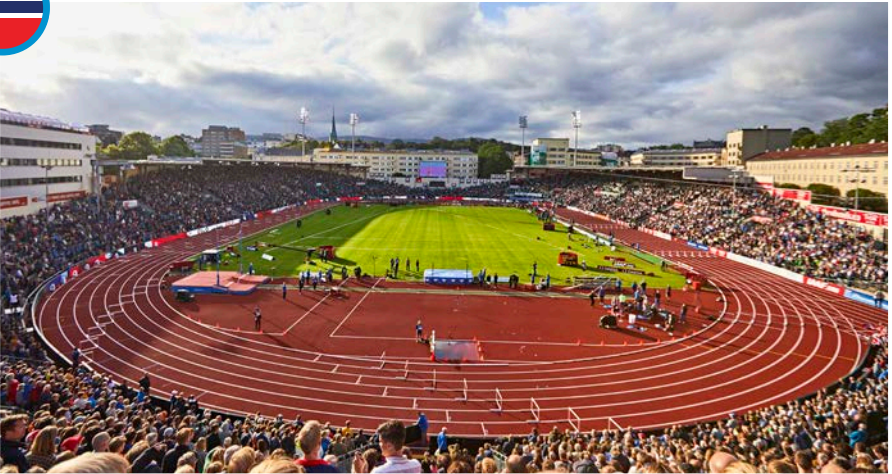
Bislett Stadium Oslo, Norway Photo courtesy of LAIDERZ ApS www.laiderz.no Stobitan® SC