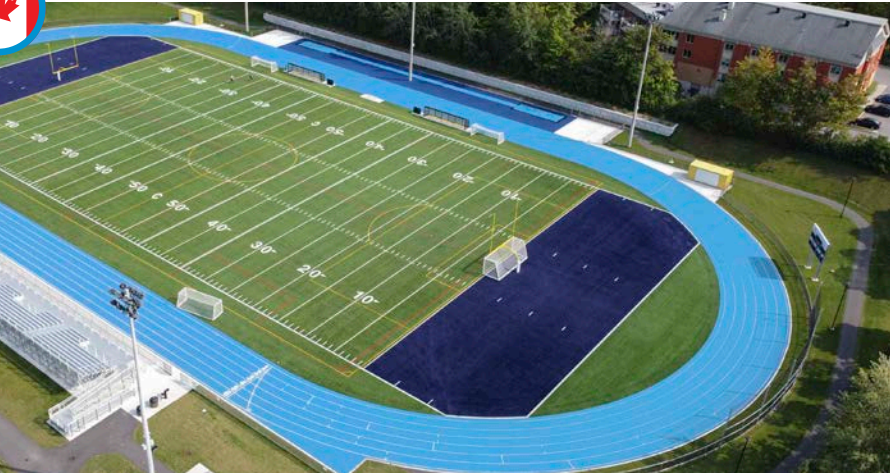
Parc-école de l'Odyssée-des-Jeunes Ville de Laval • Québec, Canada Photo courtesy of Carpell Surfaces www.Carpell.com Stobitan® SW