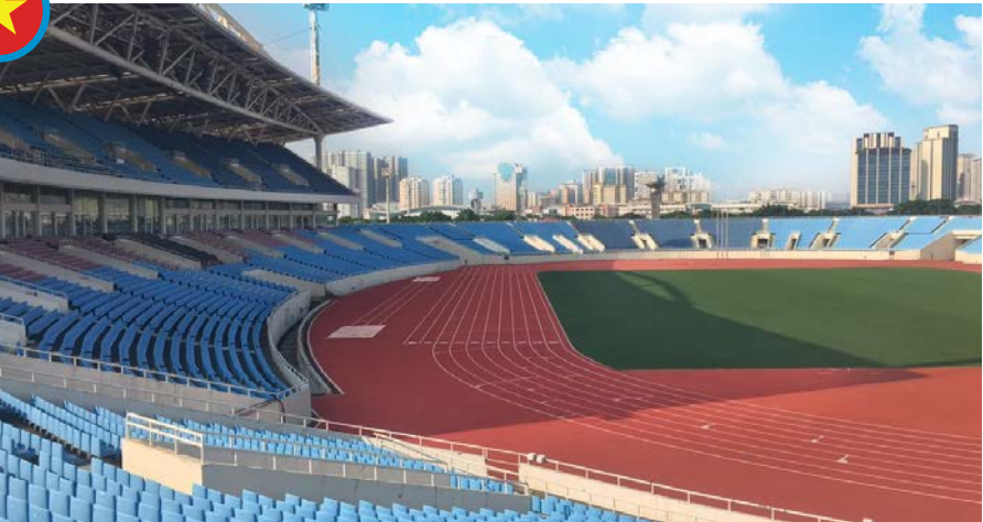
Track and Field Athletics of the Central Stadium- National Sports Complex Hanoi, Vietnam Stobitan® SW